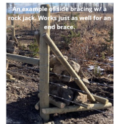
An example of side bracing w/ a rock jack. Works just as well for an end brace.