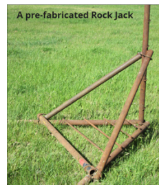
A pre-fabricated Rock Jack