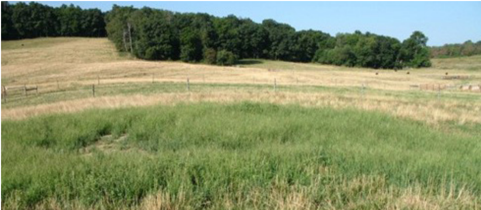
This hay feeding site was cleaned and seeded with crabgrass on April 30. By late July, in a drought, the crabgrass was over 20 inches tall and completely covered the entire feeding area. The thick crabgrass stand almost completely smothered out all broadleaf weed competition.

Because of the available plant nutrients usually present in these feeding areas, crabgrass should grow very vigorously from late June through August.