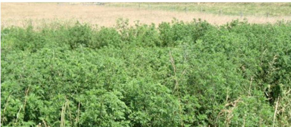
This hay feeding site was cleaned and re-seeded in early April with fescue. Note the lack of weed suppression. Although the fescue did germinate, the entire site was covered with ragweed and lambs quarter by late July.