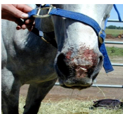
Symptoms of photosensitization include destruction of skin cells.