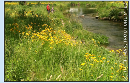
A pair of fishermen angle for trout in a restored section of Mossy Creek (Augusta County, Virginia), surrounded by a buffer of native wildflowers, grasses, and forbs

Shrubs and trees stabilize the soils along the stream and the banks. They provide shade, which helps cool the stream, increasing dissolved oxygen and the ability of fish and beneficial insects to survive. And a healthy, wooded stream