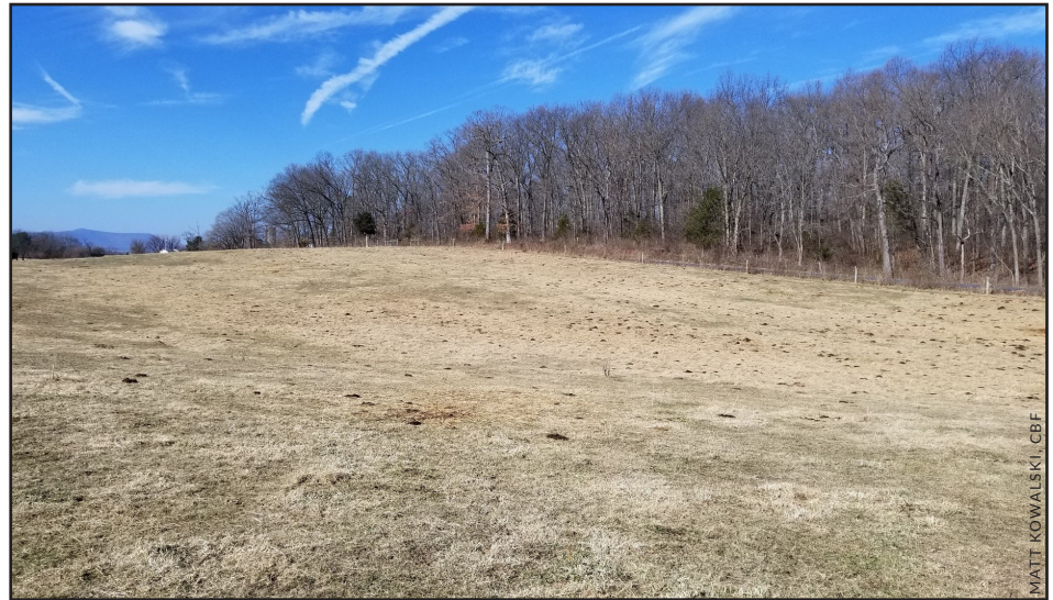
Billy Royston unrolled hay bales in this Warren County, Virginia pasture over the winter. The unused hay and manure piles are now evenly distributed, spreading the available nutrients throughout the pasture.

Some quick estimates prepared by Virginia Cooperative Extension (see Figure 1) show that an average 4 x 5-foot mixed-grass roundbale contains around 12 pounds of nitrogen, five pounds of phosphorus, and 18 pounds of potassium. So, there is about $20 worth of fertilizer in each bale!