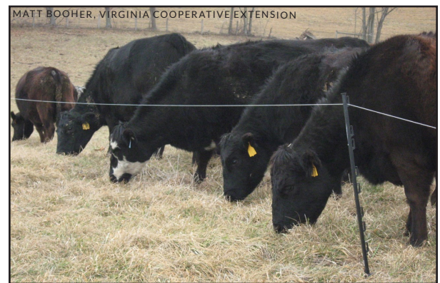
Cattle strip grazing winter stockpile.

While the stockpiled pastures accumulate growth, livestock rotationally graze the other six paddocks. The summer stockpiled