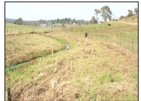
NRCS programs can help pay for installation of buffers, which help filter polluted runoff.

CRP is a program that aims to reduce soil erosion, protect the nation's production of food and fiber, reduce stream and lake sedimentation, improve water quality, establish