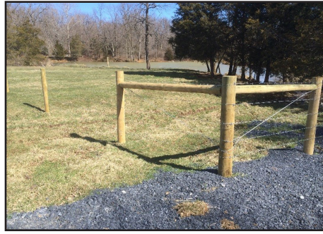
NRCS programs can help pay for fencing to keep cattle out of streams.

Under contract, applicants are required to complete an application, as well as the eligibility paperwork that is also required. Once approved, producers sign an EQIP contract, therefore agreeing to implement the desired conservation practices and maintain the practice to NRCS technical standards for its life span.