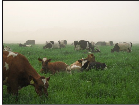
NRCS programs can help pay to establish intensive rotational grazing management systems.

land. This is a relatively new program, which combines three former programs: Wetlands Reserve Program, Grassland Reserve Program, and the Farm and Ranchland Protection Program.