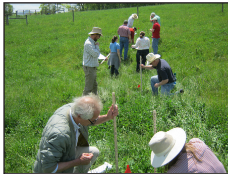
Participants at the Virginia Forage and Grassland Council Grazing School gets hands-on instruction about grazing practices.

Participants were welcomed to fields of green grass and beautiful scenery with the back drop of the Blue Ridge Mountains. The course included classroom style presentations on soils, fertility, stocking rates, forage supply, forage quality, and grazing economics. These were balanced with outdoor sessions where participants learned plant identification, pasture condition scoring, and estimating standing biomass. A pasture walk, led by David Fiske, showed some of the ongoing research occurring at the farm: comparing different stock densities and varying levels of grazing management.